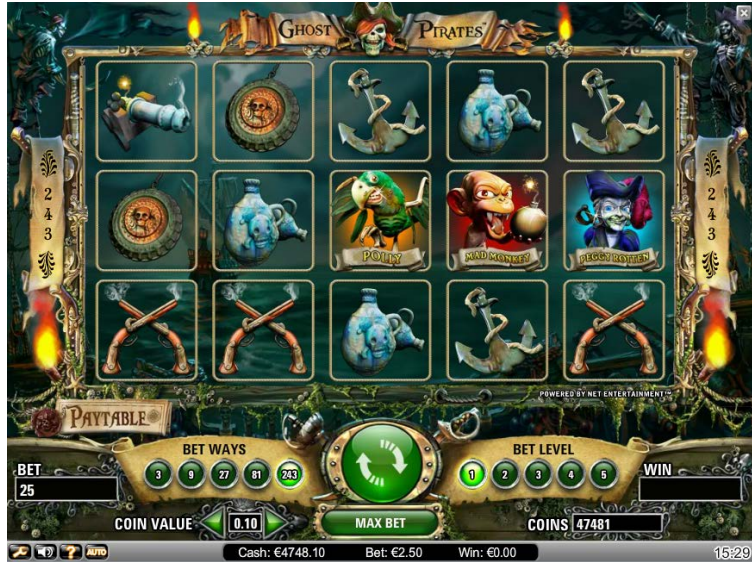
New Ghost Pirates™ game screen

Winnings from free spins are tripled except jackpot, bonus game wins and the additional free spins. Only the highest win per bet way is paid. In addition, the bet way wins pay if only in succession from left to right.