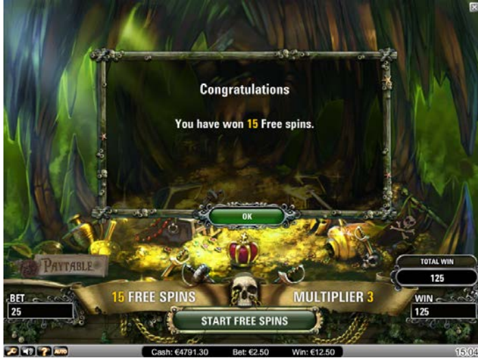
Free Spins round