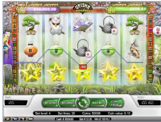
Mega Wonder Jackpot win! (5 stars)