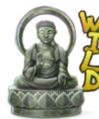
Wild - Buddha symbol