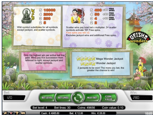
Paytable (1st page)