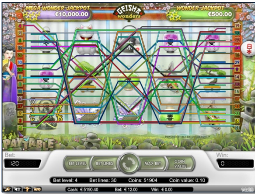
game round at Max bet

The game highlights which lines are winners and how much has been won on each line. The total winnings are added together and shown in the Win box. The amount won is added to the cash and displays in the game panel.