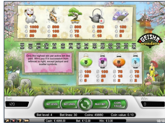
Paytable (2nd page)