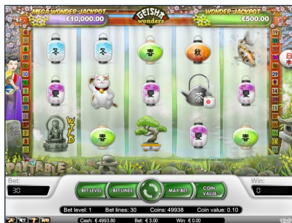
Geisha Wonders game screen