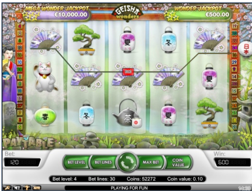
Bet Line 16 win!