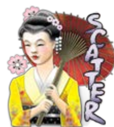
Scatter - Geisha symbol