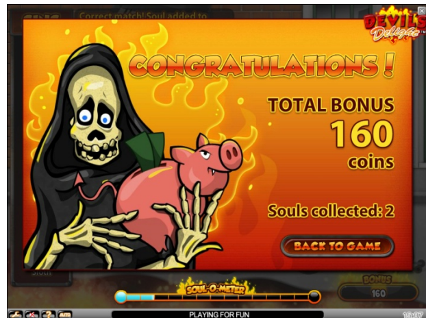
Bonus win presentation

When the player has filled up the SOUL-O-METER, (15 souls total) a special Free spin feature called Sin Spins is activated. The SOUL-O-METER total is saved for 48 hours.