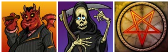
Wild, Bonus and Scatter symbols

Wild substitution – The Devil Wild symbol substitutes for any other symbol to complete a winning bet line, except scatters and bonus wins.