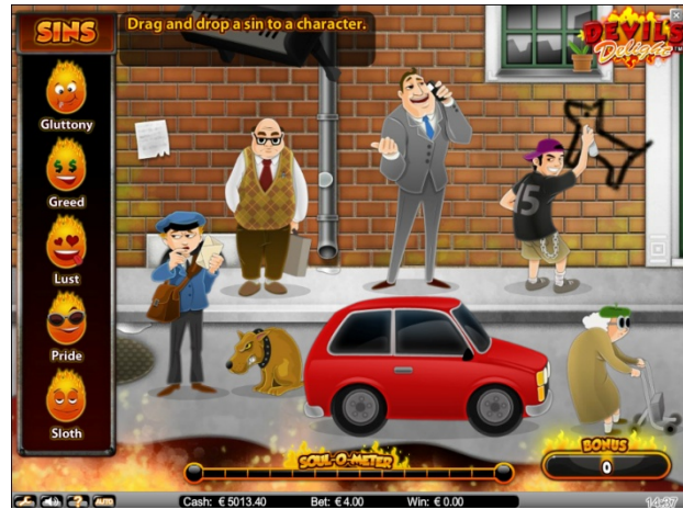
Soul Reaper Bonus Feature

Devil's Delight features an off-the-reels bonus game called Soul Reaper. The aim of the game is to claim as many souls as possible by correctly matching sins to their corresponding characters. Each correct match wins a bonus coin amount and the soul is added to the SOUL-O-METER.