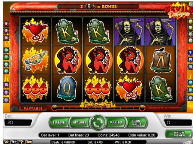
Devil's Delight game screen

The Devil's Delight slot is comprised of three main elements—video display area, keypad and game panel.