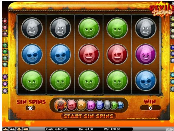
Sin Spin feature

Sin Spin wins – The player is returned to the main game after all 10 spins have been played and the amount win added to the player’s total cash.